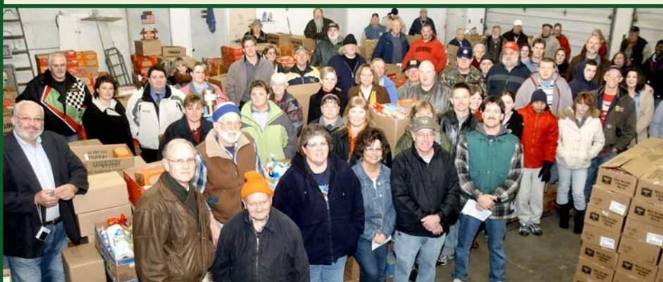
Montcalm Challenge Food Drive Participants and Pantry Volunteers

Commercial Bank won our friendly competition in the small company division by accumulating the most food items per employee. McDonald's won the large company division. Both are repeat winners from last year and will retain their trophies. Thank you to all of our employees, participants, donors, and volunteers.