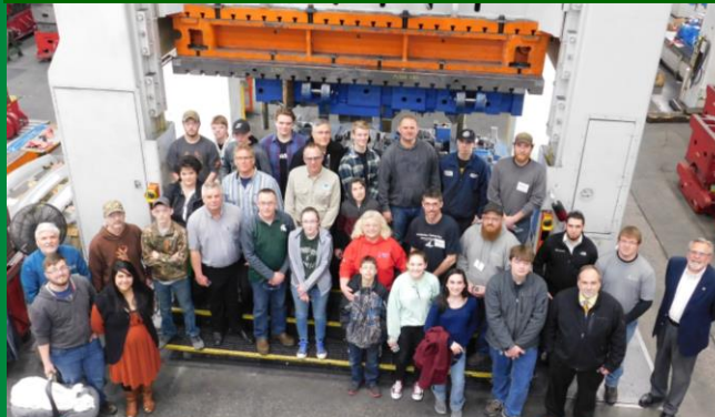
Above: All Participants of the Career Showcase

On March 6th Greenville Tool & Die Company joined in the Career Showcase event, hosting a tour for students and their parents interested in the trade. Participants learned about careers in engineering, design, tooling, machining, and die making. Our goal is to inform, educate, and entice some students into the challenging and rewarding career of tool and die. Thank you to all the tour guides and attendees.